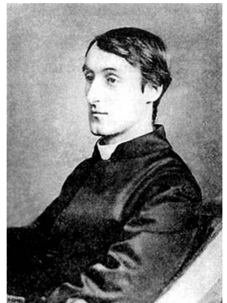
Gerard Manley Hopkins

And for all this, nature is never spent; There lives the dearest freshness deep down things; And though the last lights off the black West went Oh, morning, at the brown brink eastward, springs— Because the Holy Ghost over the bent World broods with warm breast and with ah! bright wings.